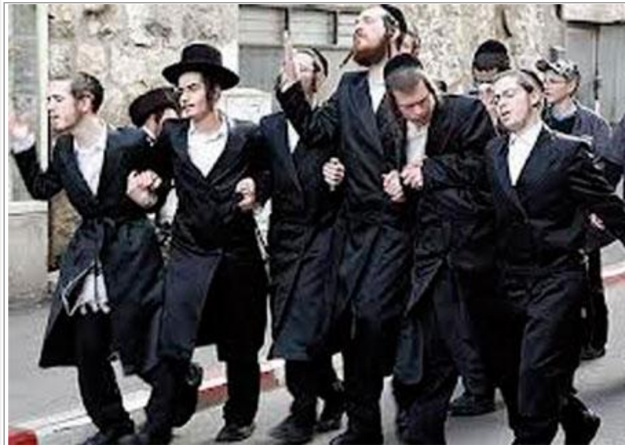
Modern-day Khazars in Israel falsely claim right to the land.