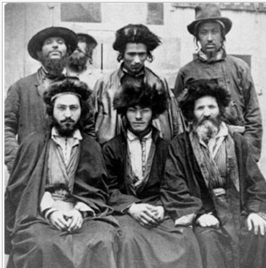
Khazar Jews in 1876. DNA studies show that today's Jews are descendents of the Khazars.

The Khazars are not Jews, but they do practice Judaism. Like the Jews, their Babylonian Talmud and Kabbalah are satanic books which they insist are greater than the Torah and the Holy Bible. These heinous texts brand Jesus a magician, liar, and a bastard burning in hell today. These texts admonish Jews to “ kill the best of the Christians ” who, it is claimed, are idolaters.